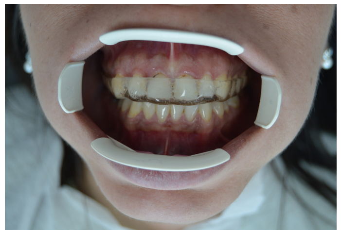
Figure 3. Muscular relaxation appliance in place.