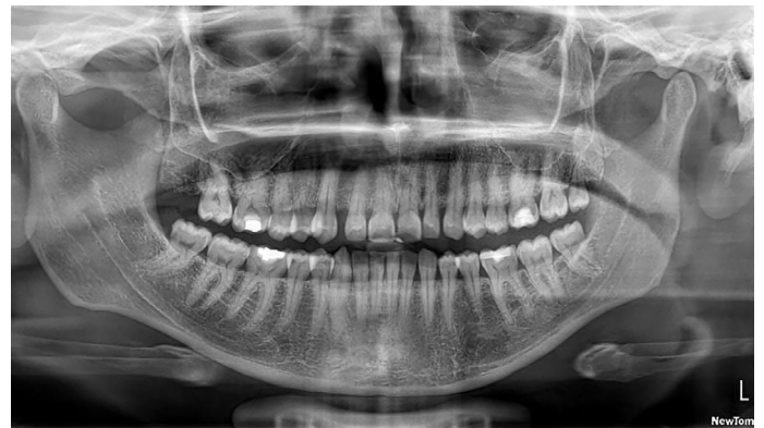
Figure 2. Initial panoramic radiography.

It is important to detect whether the pain that occurs in temporomandibular disorders is of dental origin or is related to the masticatory muscles. The muscle pain due to teeth clenching