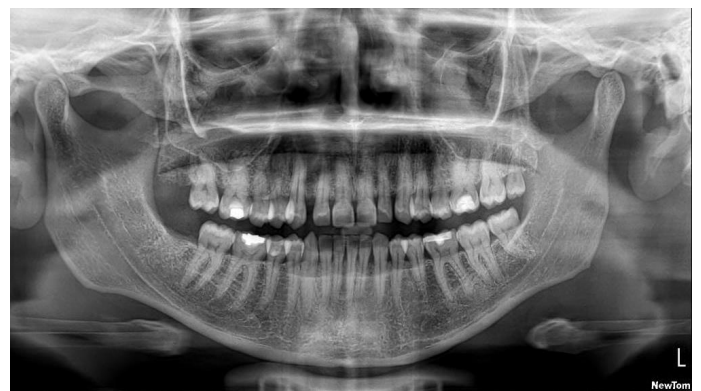
Figure 4. Panoramic radiography after extraction of the right mandibular third molar tooth.

may confuse with a toothache and lead to irreversible dental treatments. [7] Pain due to dental diseases such as dental caries and pericoronitis can also trigger the pain of masticatory muscles or increase the severity of the existing pain. [6,7]