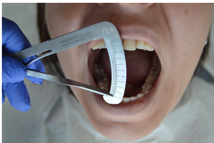
Figure 5. Elimination of mouth opening limitation.

guishing pain in the masticatory muscles from toothache. With the palpation method, trigger points in the muscles can be detected, and the patient can be warned against movements that may initiate myofascial pain by stimulating the trigger points.